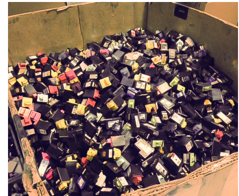
Recycled printer cartridges can be obtained for free, reducing production costs.

The whole industrial process can be thought of as a closed cycle in which the manufacturer has overall custody for the material used. In this system, the manufacturer must consider the entire material and energy stream, from materials input and manufacturing through the life of the product and its eventual reuse or disposal. This concept has begun to be embodied in law (as in Germany), making manufacturers responsible for their products through to final disposition.