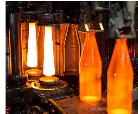
Glassmakers produce wastes that can be recycled and made into concrete, but they choose to dispose of these wastes instead because of potential liabilities they may have.

The following example from a glassmaker is illustrative. Certain nonhazardous wastes from glassmaking would make good additions to concrete, improving its properties. Nevertheless the glassmaker disposes of these wastes in a landfill, because the legal counsel worries about potential liabilities if the concrete ends up in an apartment house or a highway. Such liability risks are hard to predict and quite unacceptable in comparison with the more predictable liabilities related to landfill disposal.