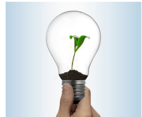
Organic material can be burned and be used as an alternate source of energy.

The manufacturing process tends to mix materials that are further mixed in the process of waste disposal. In re-manufacturing, one generally wants to separate things into their original components and materials. There are costs involved in collecting, sorting, and transporting used-up products, scrap, and waste. Such separation requires information, effort, and energy, which must all be paid for. These costs must be compared with the costs of new materials.