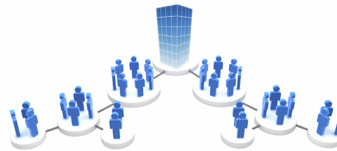
Organizations can delay implementation because of overheads such as communication problems and conflicting internal interests

The internal organization of a firm can be difficult to change. Changing the whole concept of a product or adding new criteria for environmental compatibility to the design process may not fit the ideas on which the firm operates or its internal incentive system. The business structure may make perception and solution of problems that cross organization lines very difficult.